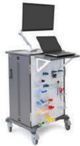
YES24 Adjusta™ Charging Cart YES24-CHR-1 white