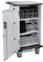
YES Basic Charging Cart YESBASGMPW4 white