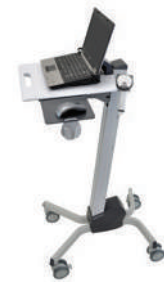
Neo-Flex Laptop Cart 24-205-214 two-tone grey