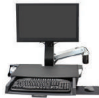
StyleView Sit-Stand Combo Arm Combo Arm with worksurface: 45-260-026 polished aluminum Combo Arm: 45-266-026 black head-assembly only, polished aluminum Extender Arm: 45-261-026 polished aluminum