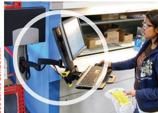
200 Series Combo Arm