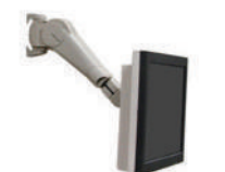
400 Series Wall Mount LCD Arm 45-007-099 grey 45-007-085 black