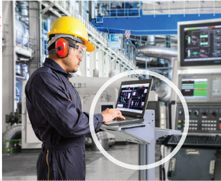
Neo-Flex Laptop Cart