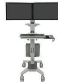
Neo-Flex WideView WorkSpace Dual LCD 24-194-055 two-tone grey