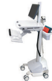
StyleView™ 42 Series LCD pivot version shown Powered with SLA or LiFe battery