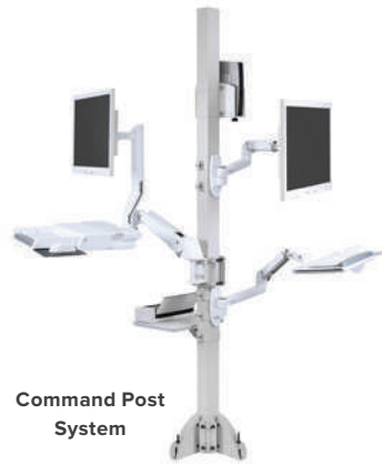
Command Post System