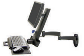
200 Series Combo Arm 45-230-216 white 45-230-200 black