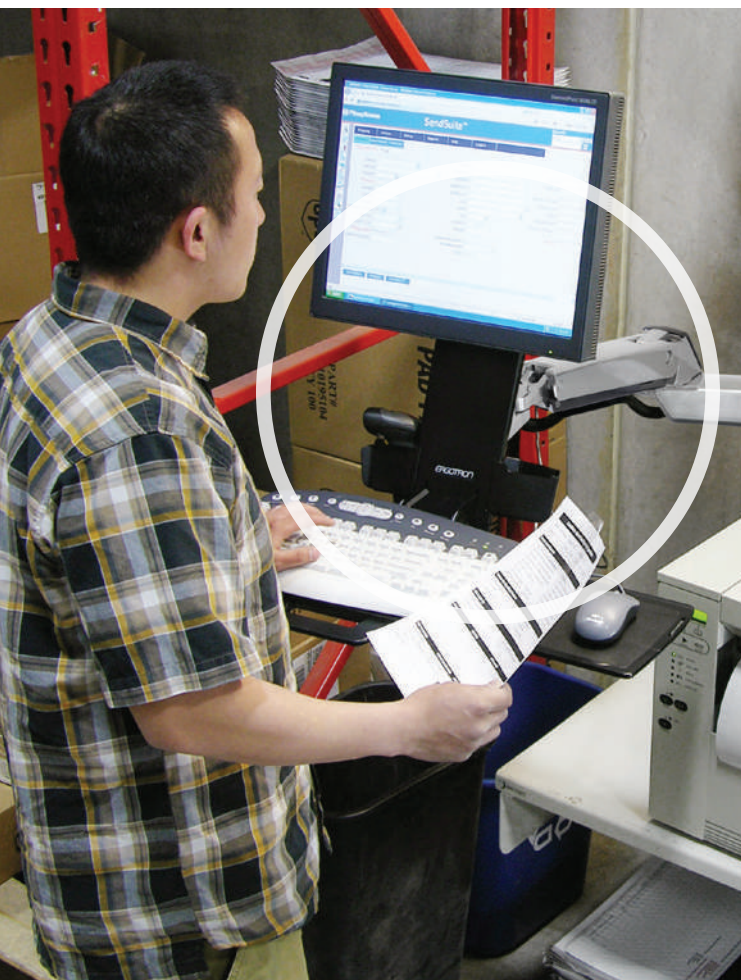
StyleView™ Sit-Stand Combo System