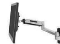
LX Sit-Stand Wall Arm 45-353-026 polished aluminum HD 45-383-026 polished aluminum