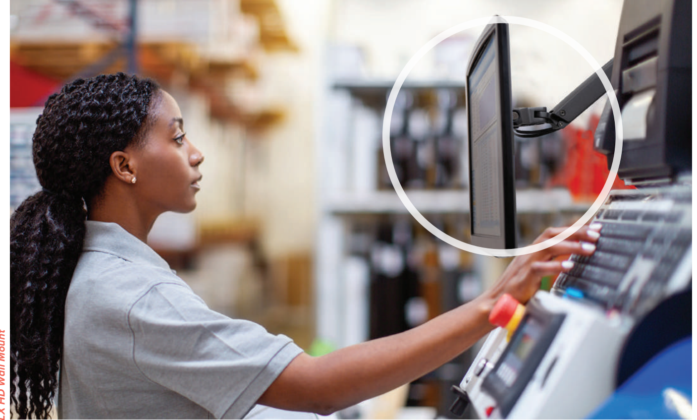
LX HD Wall Mount