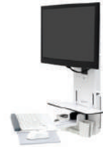
StyleView Sit-Stand Vertical Lift Patient Room 61-080-062 white Patient Room 61-080-085 black High Traffic Area 61-081-062 white High Traffic Area 61-081-085 black