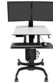
WorkFit™-C LCD LD (Light Duty) 24-215-085 black LCD HD (Heavy Duty) 24-216-085 black Dual 24-214-085 black