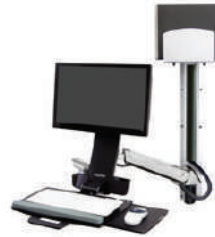
StyleView Sit-Stand Combo System Combo System with worksurface: 45-270-026 Combo Arm, medium CPU holder and wall track, polished aluminum 45-272-026 Combo Arm, small CPU holder and wall track, polished aluminum Combo System: 45-271-026 Combo Arm, medium CPU holder and wall track, polished aluminum 45-273-026 Combo Arm, small CPU holder and wall track, polished aluminum