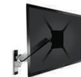
Interactive Arm HD 45-296-026 polished aluminum VHD 45-304-026 polished aluminum