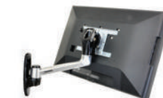
LX HD Wall Mount Swing Arm 45-268-026 polished aluminum Pivot 45-269-009 black