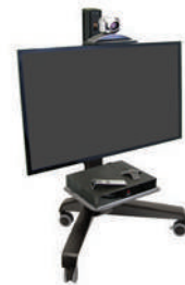
Neo-Flex™ Mobile MediaCenter LD (Light Duty) 24-190-085 black VHD (Very Heavy Duty) 24-191-085 black UHD (Ultra Heavy Duty) 24-192-085 black Camera Shelf Kit 97-491-085