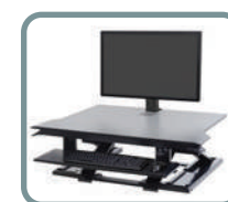
Single Monitor Kit