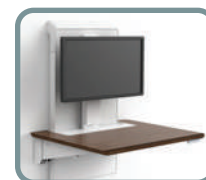
JÜV Single Monitor Riser Kit