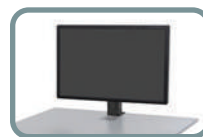
Single Monitor Kit