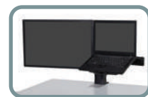
LCD & Laptop Kit