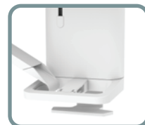
Slim Profile Clamp Kit