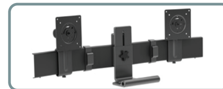
Dual Conversion Kit