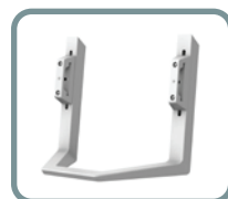
Dual Direct Handle Kit