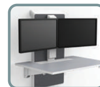
JÜV Dual Monitor Riser Kit