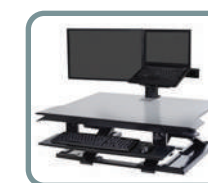
LCD & Laptop Kit