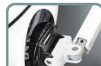
Heavy-Duty Tilt Pivot