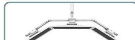
Triple Bow Kit