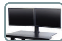
Dual Monitor Kit