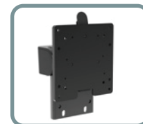
Single Conversion Kit