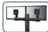
Dual Tall User Kit