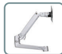
Extension & Collar Kit