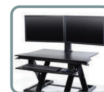
Dual Monitor Kit