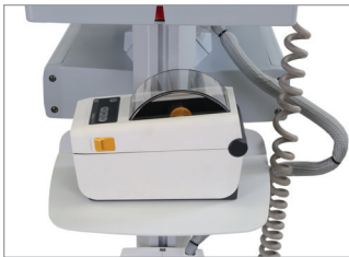
Rear Utility Shelf