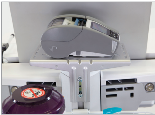
Printer or Scanner Shelf