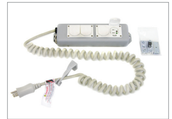
Medical-Grade Power Strip

Download additional resources at ergotron.com .