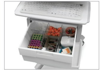
Single Tall Drawer (included)